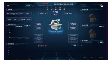
智能物联网系统 GOATS-IIoT System.