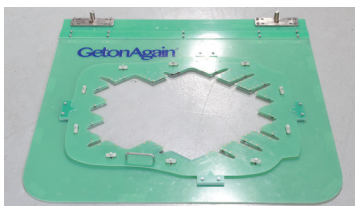
模板工装 Template Fixture