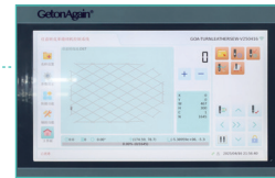
15寸高清晰工业触摸式中控屏 15-inch HD industrial touch control screen